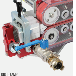
V3 DUCT CLAMP