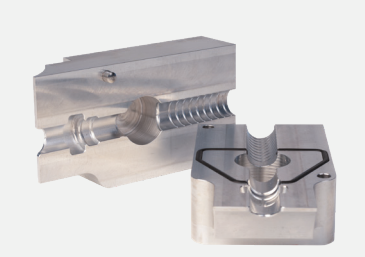
DUCT CLAMP (AVAILABLE IN DIFFERENT SIZES)