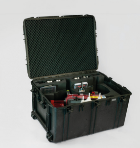
V3 TRANSPORT CASE WITH FOAM INSERT

CABLE GUIDE (AVAILABLE IN DIFFERENT SIZES)